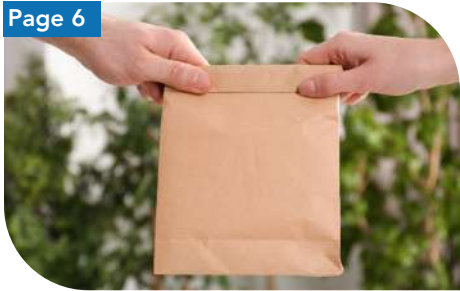
SOS kraft brown square bottom bag

Ideal for convenience store, supermarket and food service.