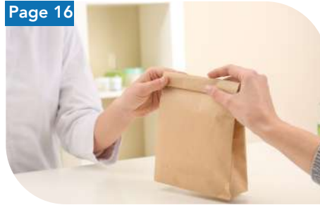
Pharmacy SOS kraft square bottom bag

Square bottom bag for pharmacy and drug store.