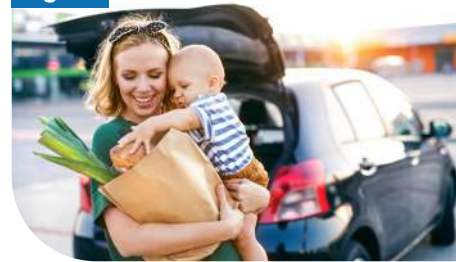
Carry all sacks 1/6 bbl 1/7 bbl 1/8 bbl

Large format SOS bag for groceries and retail.