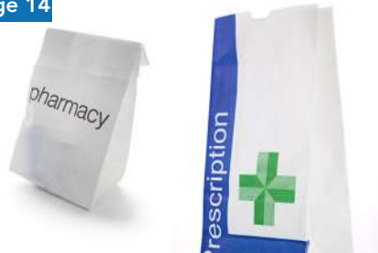
Pharmacy SOS bleached square bottom bag

Square bottom bag for pharmacy and drug store.