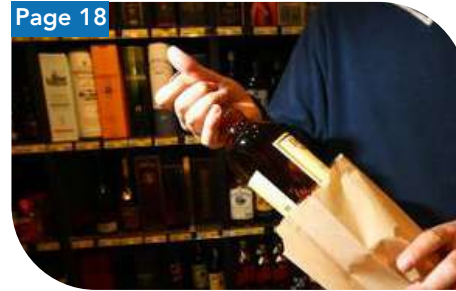
Liquor & wine bottle bag

Bottom bag for liquor / wine / beer store.