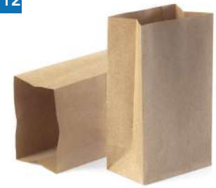
SOS kraft heavy duty square bottom bag #50

Heavy duty SOS bag made from thicker paper.