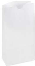
SOS KRAFT bleached square bottom bag

Ideal for convenience store, supermarket and food service.