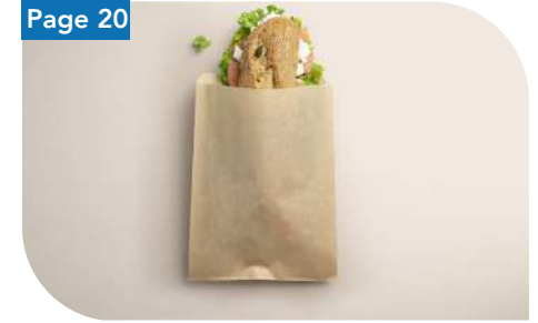
Grease Resistant (OGR) sandwich bag / brown kraft flat bottom